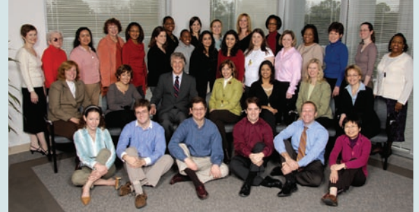
Department of Epidemiology

Research conducted by the American Cancer Society in the 1950s – involving thousands of participants and volunteers – revealed the now well-known link between cigarette smoking and lung cancer. Data provided by the 1.2 million study participants who are a part of Cancer Prevention Study-II (CPS-II) highlighted the link between obesity and risk of various types of cancer. What will the findings from Cancer Prevention Study-3 (CPS-3) be? What new discoveries about cancer prevention might be revealed as a result of your involvement in this landmark